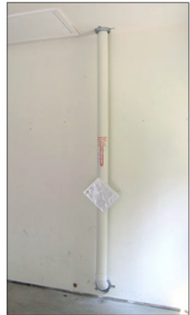
An example of a radon-control vent pipe.

A passive radon control system must be installed within any addition to a dwelling that currently has a (code compliant) radon control system incorporated into the existing dwelling (section 1303.2400, subp. 1, item H).